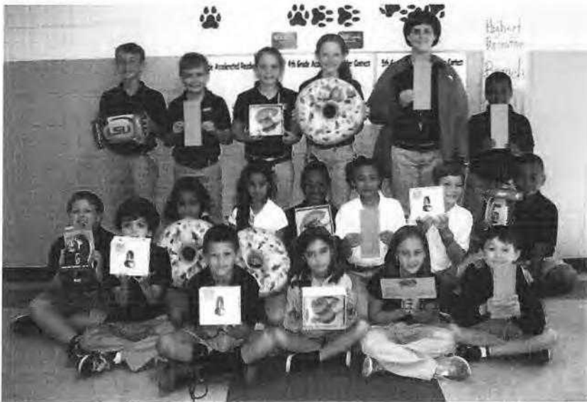
Franklinton Elementary School

The Schedule of Compensation Paid to School Board Members is presented in compliance with House Concurrent Resolution No. 54 of the 1979 Session of the Louisiana Legislature. Compensation of the School Board members is included in the general administrative expenditures of the General Fund. In accordance with Louisiana Revised Statute 17:56, the School Board members have elected the monthly payment method of compensation. Under this method, each member of the School Board receives $600 per month, and the president receives $700 per month for performing the duties of his or her office. The Schedule of Compensation, Benefits, and Other Payment to Agency Head is presented in accordance with Act 706 of the 2014 Session of the Louisiana Legislature.