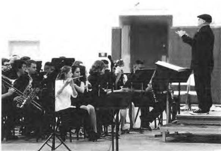
Franklinton High School