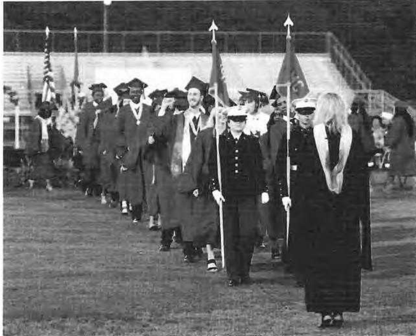
Franklinton High School