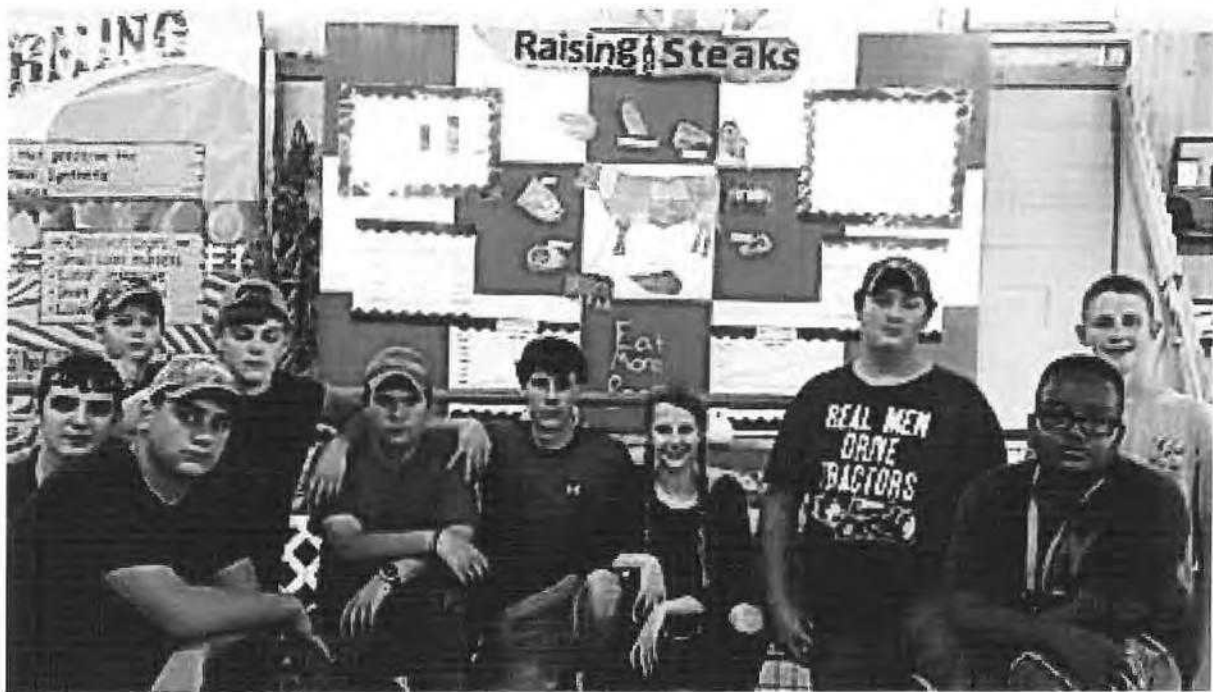
Varnado High School