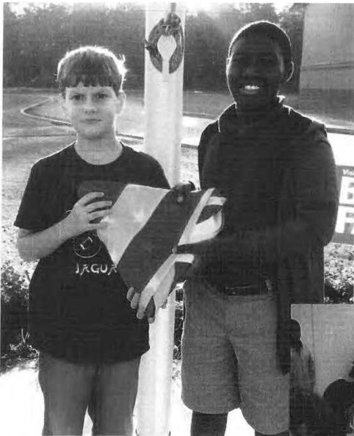
Franklinton Elementary School