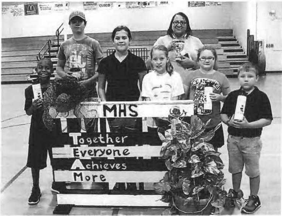
Mt. Hermon School