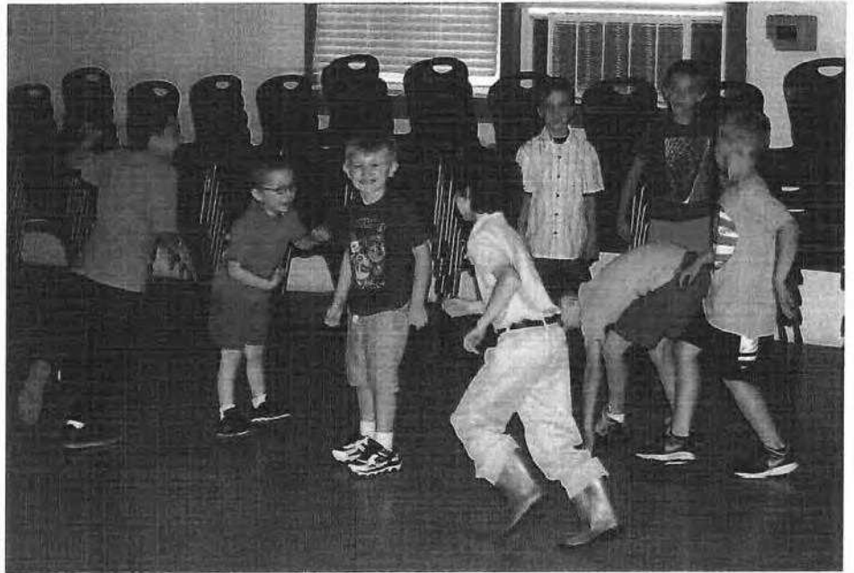
Enon Elementary School

The School Activity Agency Fund accounts for monies generated by the schools and organizations within the schools of the parish. While these accounts are under the supervision of the School Board, they belong to the individual school or their student bodies and are not available for use by the School Board.