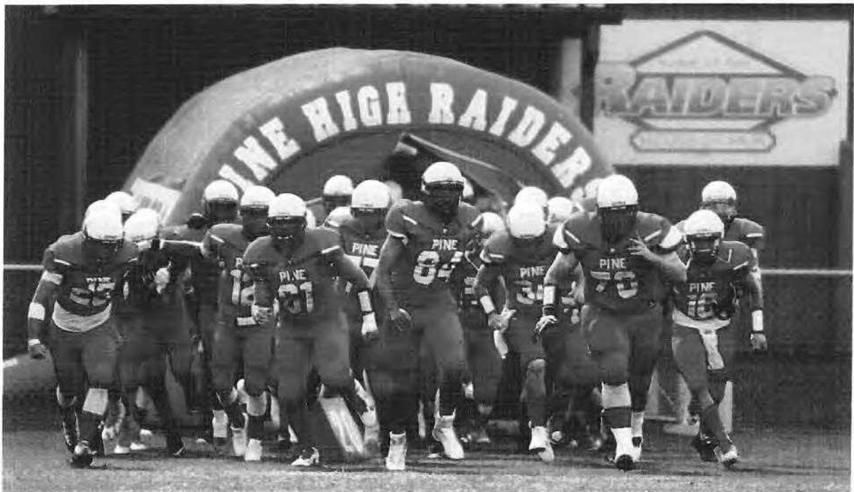
Pine High School