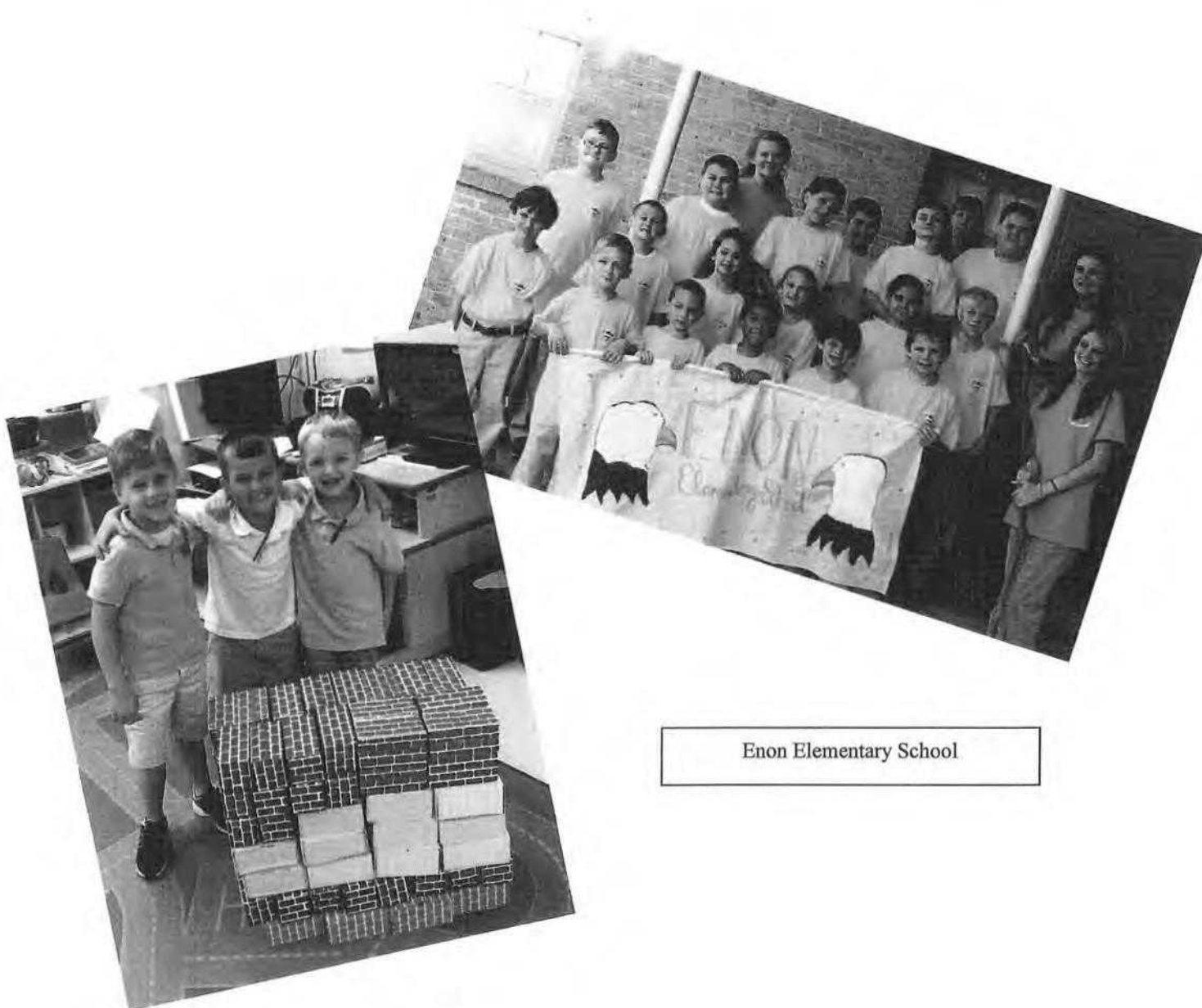
Enon Elementary School

The Franklinton-Enon Capital Projects fund accounts for excess funds collected from the bond issue originally issued for the construction of Franklinton High School and renovations to Franklinton Junior High and other various projects within the district. The Franklinton-Enon bonds have been paid in full and excess funds collected from the taxes may be used for the same purpose as the original bond issue, purchase of land, and capital construction within the district. As a capital projects fund, a budget is not required.