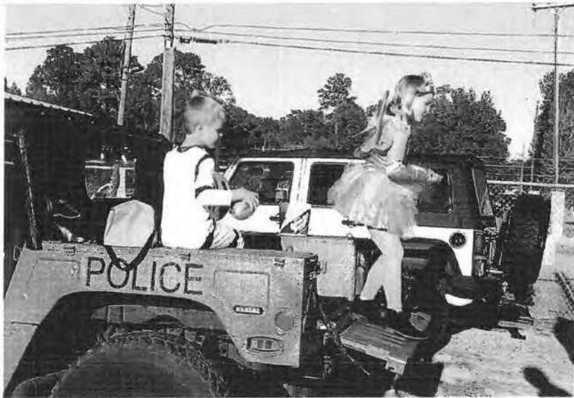
Franklinton Primary School