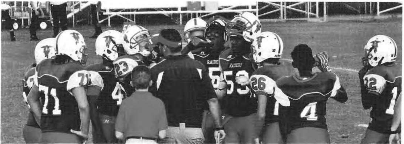
Pine Jr. High School

In accordance with Office of Management and Budget Uniform Guidance, a Schedule of Expenditures of Federal Awards and related notes are presented.