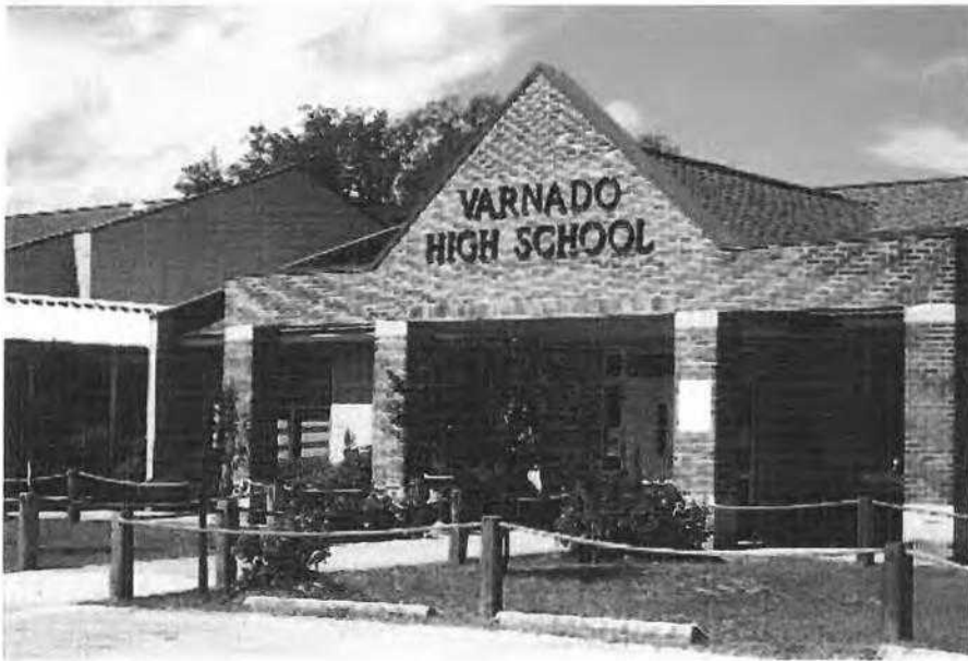
Varnado High School

The Varnado, Mt. Hermon, and Franklinton-Enon School District Debt Service Funds accumulate monies for the payment of remaining bond issues and/or improvements to those districts. The bond issues are financed by a special property tax levy on property within the territorial limits of the appropriate school districts. As debt service funds, budgets are not required.