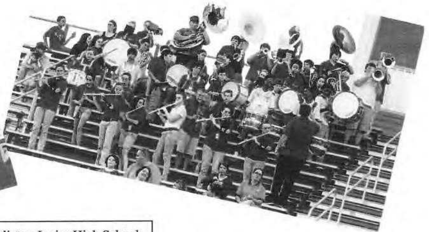
Franklinton Junior High School