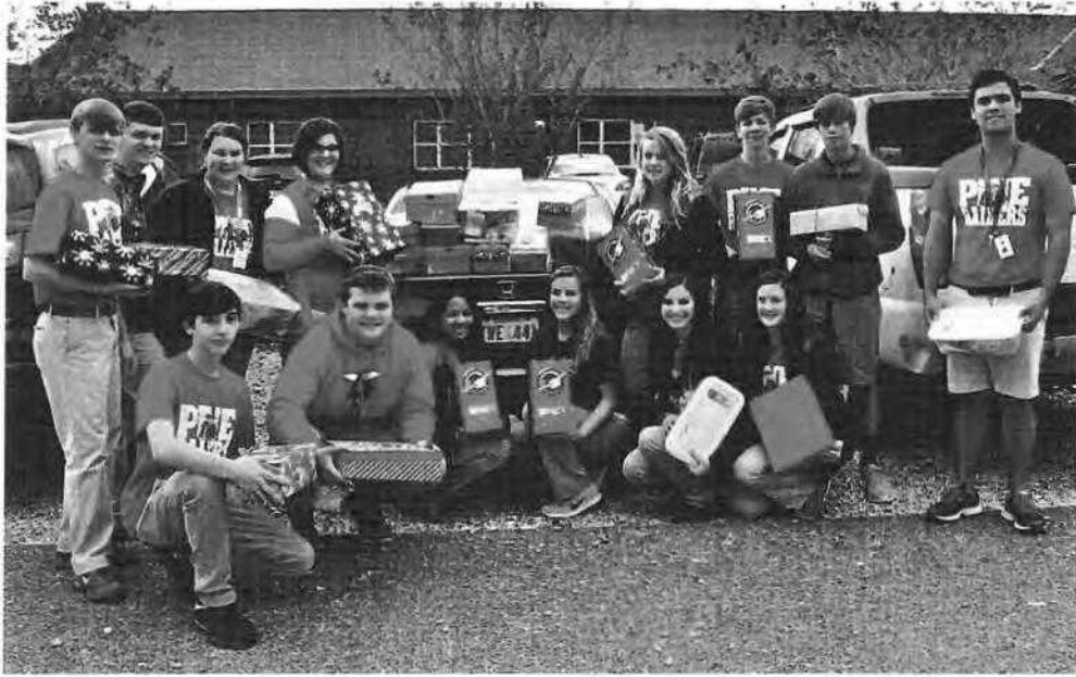
Pine High School