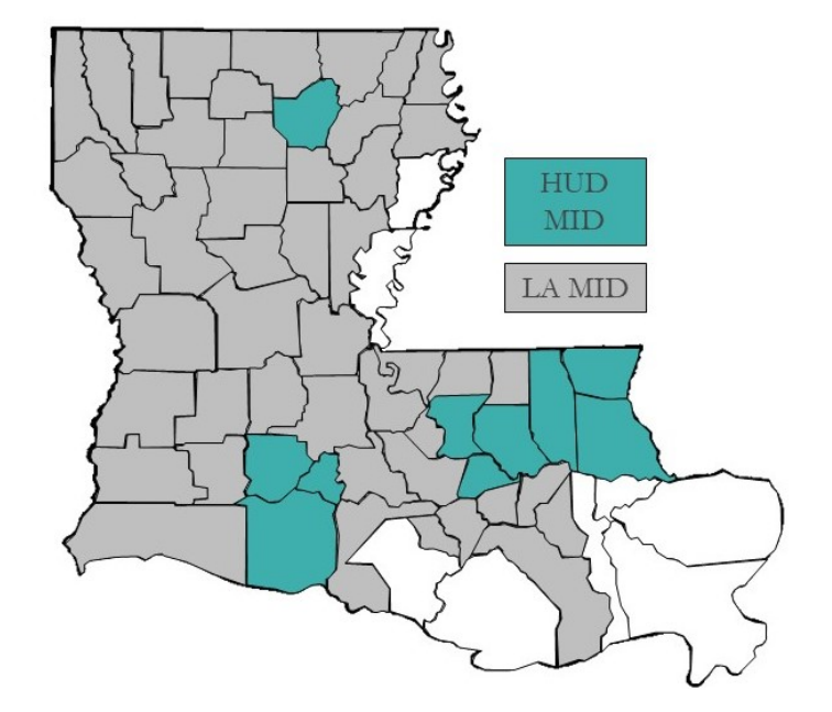
Exhibit 2 Most Impacted and Distressed Parishes Identified by HUD and Louisiana* As of May 2022

HUD MID: Acadia, Ascension, East Baton Rouge, Lafayette, Livingston, Ouachita, St. Tammany, Tangipahoa, Vermilion, Washington